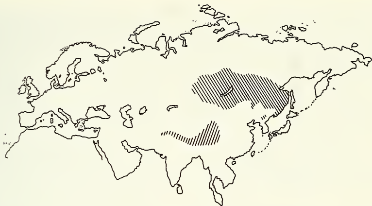
Figure 1. Distribution of (nominative) Phylloscopus proregulus ||| and P. (p.) chloronotus (see text) (including simlaensis ) ||||. Based on Cheng (1987), Harrison (1982) and personal experience.

chloronotus in Nepal in 1983 and in China in 1986, 1987 and 1989; and simlaensis in Kashmir in 1983. We are subsequently of the opinion that P. proregulus ( sensu lato ) should be divided into 2 species, P. proregulus (monotypic) and P. chloronotus (with subspecies chloronotus and simlaensis ). Alström, Colston & Olsson (1990) indicate the likelihood of a new species, which has possibly been overlooked because of its close similarity to sympatric chloronotus .